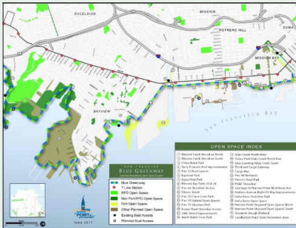
San Francisco Blue Greenway, San Francisco, CA