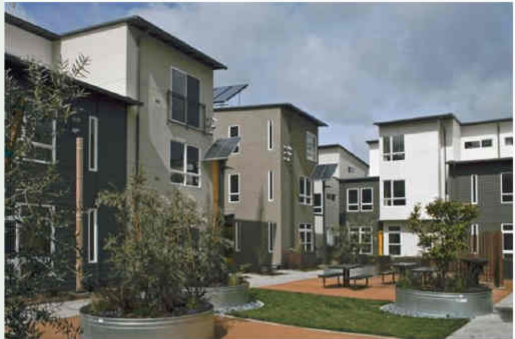
The Tassaforanga Apartments - Village Square