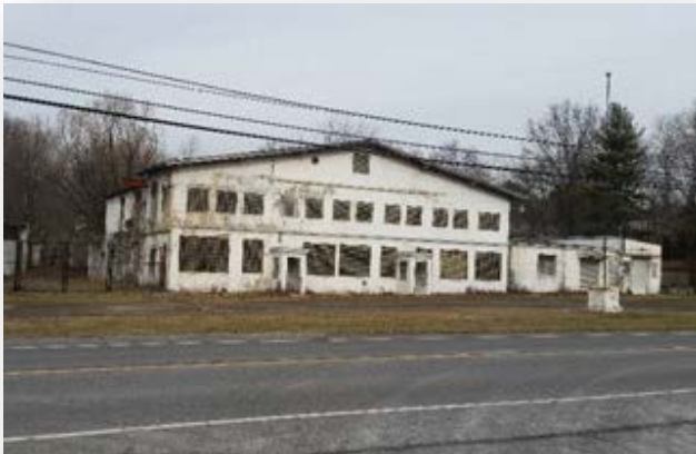
High Bridge Borough Exact Tool Site