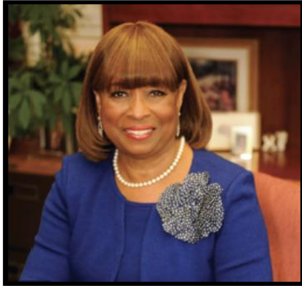
Lula Davis-Holmes Mayor of Carson, CA